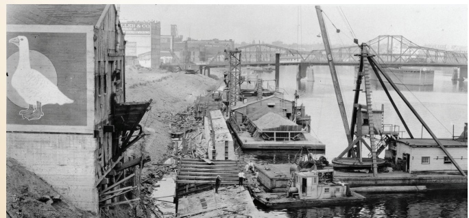
Construction of Portland’s Harbor Wall, August 1928.

Research walk-in hours Thursday afternoon, other hours by appointment. No online records. Current exhibit through December 2015: Pioneering Nursing Education in Oregon