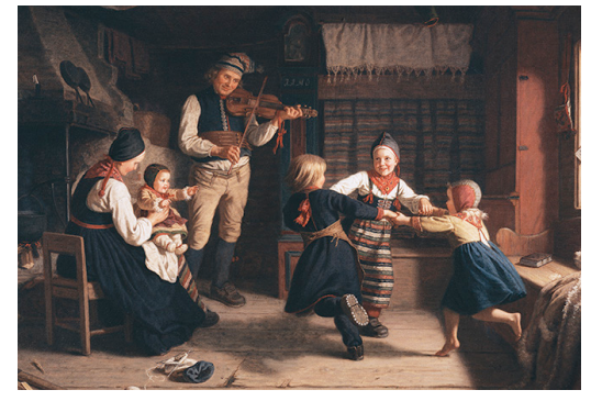
Söndagsafton i en dalastuga, Amalia Lindegren, 1860