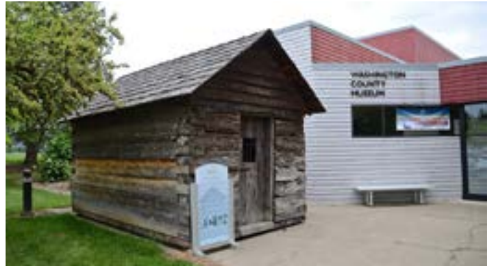
The old Washington County Jail, a log building that was in use as a jail from 1853 to 1870, in front of the Washington County Museum, on Portland Community College's Rock Creek Campus, 2018.

The rebranding to Five Oaks Museum in 2020 signified a shift towards embracing a more inclusive narrative, reflecting the diverse cultures and histories of Washington County. Named after a historic gathering place of the local Kalapuyan people, the museum aimed to serve as a communal space for art, culture, and storytelling. Despite these efforts, financial instability led to an indefinite closure starting 29 December 2024, with the entire staff furloughed as the institution faced a cash-flow shortage. The situation is detailed in an article on OregonLive