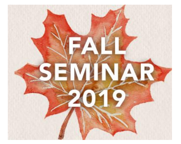
October 5th, 10 a.m. – 4:3 p.m. and October 6th, 9:30 a.m. – 12 p.m.