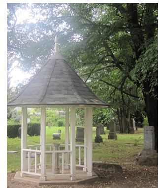
Historic Columbian Cemetery