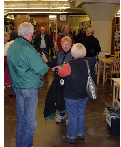
Model A Ford Club Tours the GFO