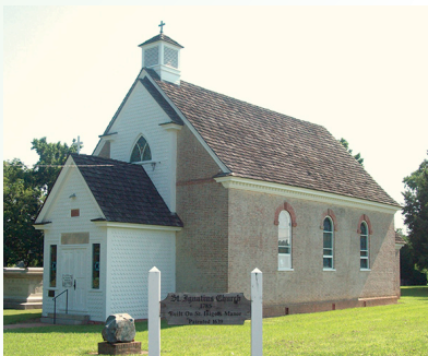
St Ignatius Roman Catholic Church at St. Inigoes, Maryland, constructed between 1785 and 1787.

http://www.findmypast.com/catholicrecords