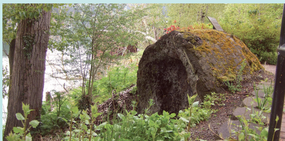
Crucible from the Oregon Iron and Steel Company, Lake Oswego, Oregon, May 2009.