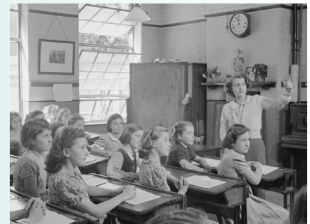
Geography lesson, St. Joseph's Elementary School, Upper Norwood, UK, 1945. Accessed at Wikimedia Commons.

There is a Sunday morning workshop —Maps! Wonderful Maps!—that will cover traditional and online resources of maps, reading, interpreting, correlating map information with other documentation, problem solving, and hands-on work.