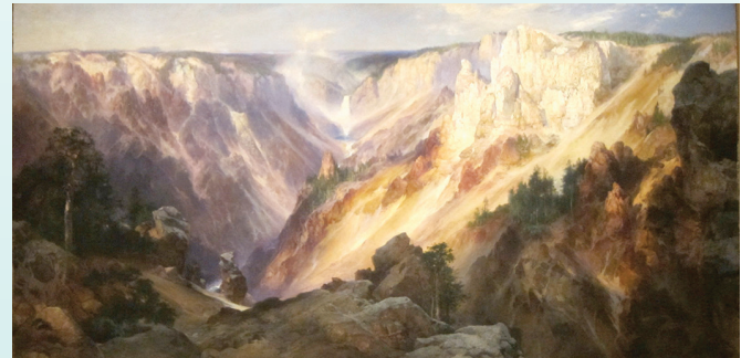
Grand Canyon of the Yellowstone by Thomas Moran, 1904.