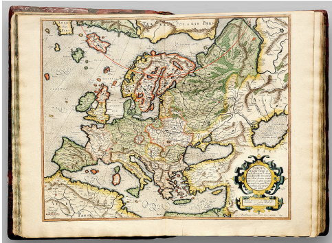
Gerardus Mercator's map of Europe (printed in 1596)