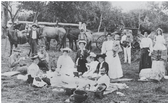
Family picnic at Annan River, Queensland, about 1890-1900.

Milwaukie Elks 13121 SE McLoughlin Blvd. Milwaukie, Oregon