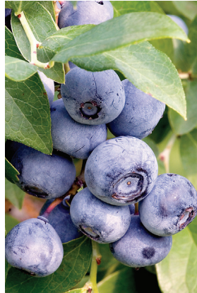
Blueberries on branch