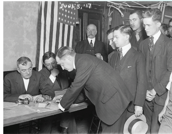
Young men registering for military conscription, New York City, June 5, 1917.