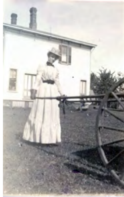
A woman in Forest Grove, Oregon, circa 1890–1910. This photograph is part of the Nettie Shipley Haines photograph album, Washington County Heritage Online .

Washington County was originally the Tuality District (also recorded as Twality District). The district was created by the Provisional Legislature on 5 July 1843. Tuality was one of the original four counties of Oregon. 1 Clatsop County was separated from Tuality County in 1844 and the remaining Tuality County was renamed Washington County on 3 September 1849 by the Territorial Legislature. The county was named for President Washington. 2 Washington County is the second most populous county in Oregon with a recorded population of 600,372 on the 2020 U.S. Census. 3