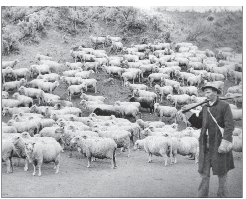
Unidentified herder with his band of sheep.

both summer and winter, even after the severe winter of 1860/61 when all stockmen sustained huge losses. However, as sheep used more of the land, cattle had to range farther to find food. That meant cowboys had to ride farther to round them up, and more riders might be required. In 1888, the Burns newspaper was reporting many hundreds of cattle being driven from Crook County to the Snake