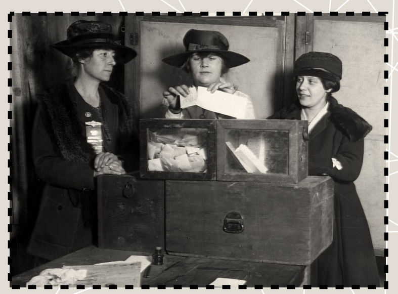
"Three suffragists casting votes in New York City," Library of Congress, Iccn.loc.gov/97510725