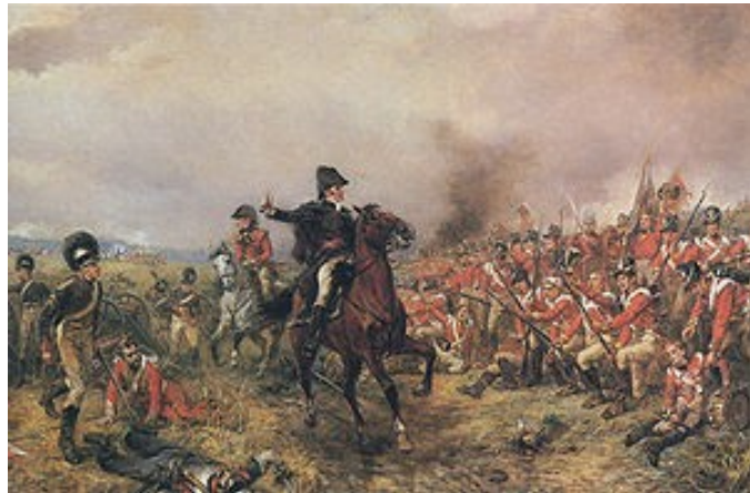
Wellington at Waterloo