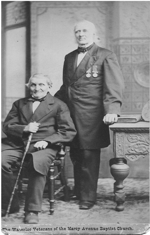
The Waterloo Veterans of the Marcy Avenue Baptist Church.