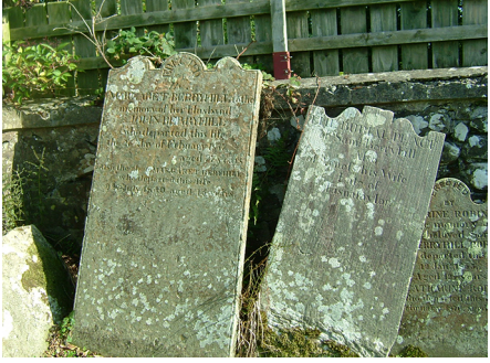
Berryhill Tombstones, Carmavey Cemetery

The next day we visited Kilead, suggested by a genealogist from