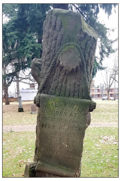
James Kintrea grave marker, Columbia Pioneer Cemetery, Portland, Oregon.

The coroner's records have not been digitally indexed by either the Multnomah County Digital Archives or FamilySearch, but the records themselves have an alphabetical index at the start of the record book.