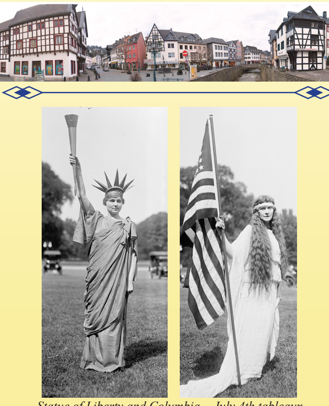
Statue of Liberty and Columbia ~ July 4th tableaux, Washington D.C., 1919.

While available in hardbound ($65 each), we would like to get the less expensive softbound editions, with a list price of $34.95 each. Through special arrangement, the publisher has agreed to give GFO a 15% discount on this large purchase if we order them all at one time. With the discount, if GFO purchased all of the available volumes today, the bill would total about $1,396 – a savings of about $246! Won't you help by donating what you can today to this special fund? Small, medium or large contributions – all will be accepted with deep gratitude! Questions? Please send us an e-mail at give@gfo.org , or leave a message for Liz or Laurel at 503-963-1932.