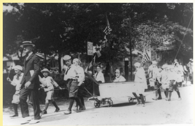
Ferndale, CA, 1911 ; American Colony, Jerusalem, between 1905 and 1913; Takoma Park, MD, 1923