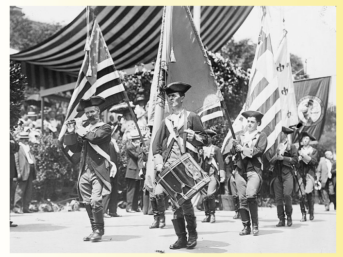
4th July Parade, 1911, N.Y.